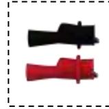
Alligator Clip (optional)